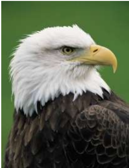
Raptor Presentation from Auburn University February 18, 2011 WAR EAGLE!!!